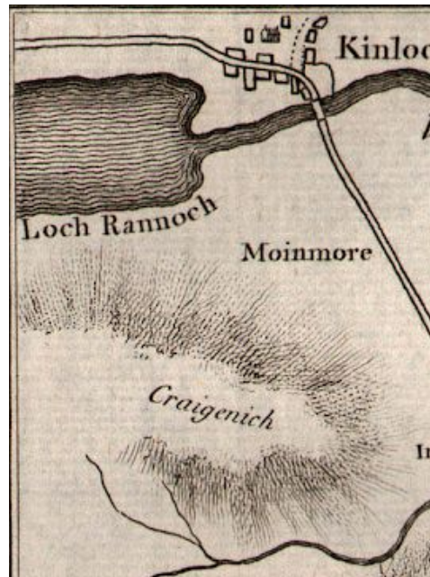
Above left: Plan of the Operations of General Washington against the King's Troops in New Jersey; Above right, A Sketch of SCHHALLIEN, With Part of the HILLS, and other Places adjacent, from the National Library of Scotland Map Library. Compare to topographical lines, below: