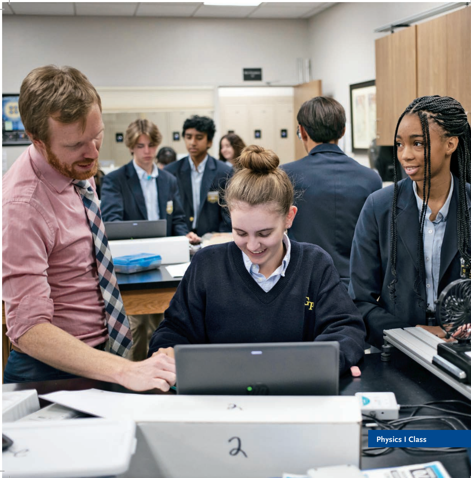
Physics I Class